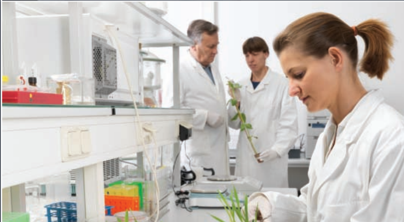
B1b: research & development