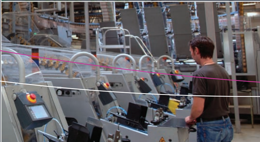
B1c: light industrial